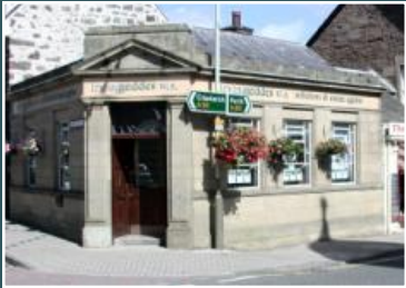
Comrie 1 Drummond Street, PH6 2DW Tel: 01764 670325 Fax: 01764 679400