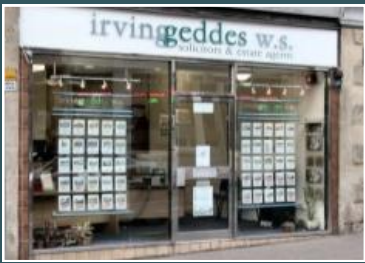
Crieff 25 West High Street, PH7 4AU Tel: 01764 653771 Fax: 01764 654 654