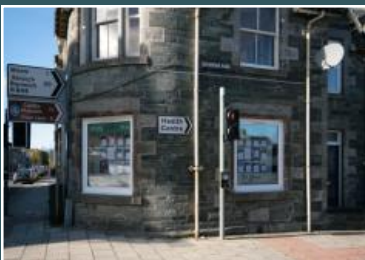
Aberfeldy 2 Kenmore Street, PH15 2BL Tel: 01887 822 722